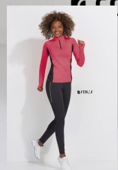
LONDON WOMEN 01411